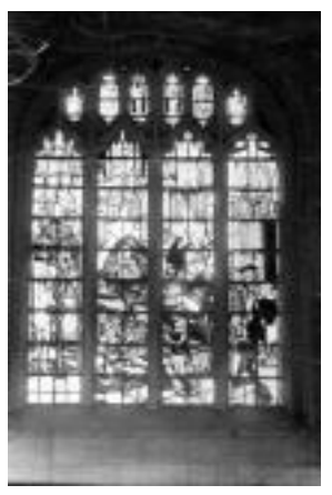
St Mary's Church, Fairford